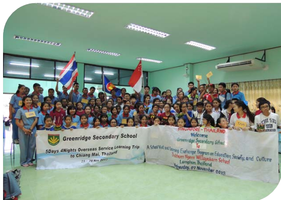
Greenridge Secondary School students and staff at one of the schools visited, Thakhum Ngern Wittayakarn School, Thailand.

It was indeed an enriching and memorable experience for students and teachers alike as they learned much from the various interactions with the Thai students and locals, opening up their eyes and broadening their minds.