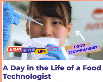
A Day in the Life of a Food Technologist

provides consolidated information about different jobs and industries - key responsibilities, skills, career paths and more!